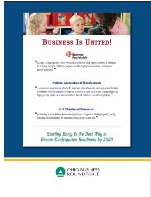
Ohio Business Roundtable The Talent Challenge?

Contact us at: ReadyNation (202) 657-0600 info@readynation.org www.readynation.org twitter: @Ready_Nation